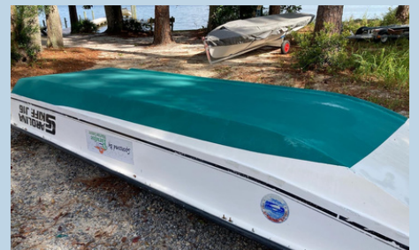
Step 3: And a couple coats of new bottom paint :)