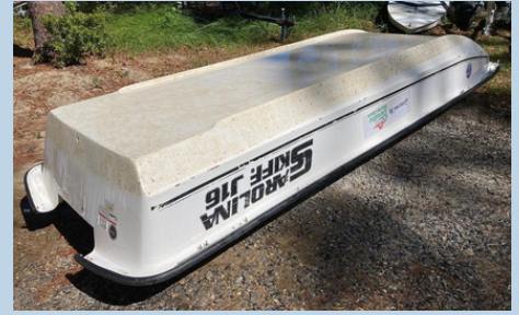
Step 1: No more bottom fouling on the skiff!

Jackie McGonigal W&WLC Coordinator 26233 Canal Rd Orange Beach AL 36561 jmcgonigal@orangebeachal.gov 251-424-5909