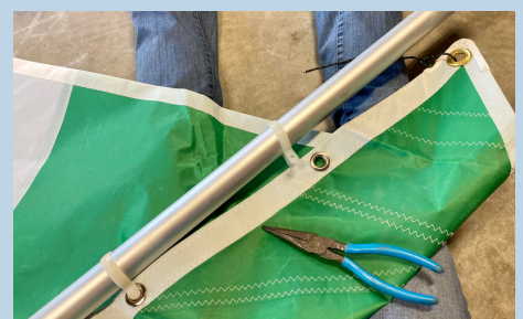
152 new sail rings. Thank goodness for needle nose pliers!