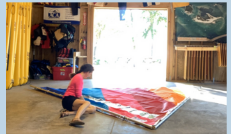
Switching out old sails for new