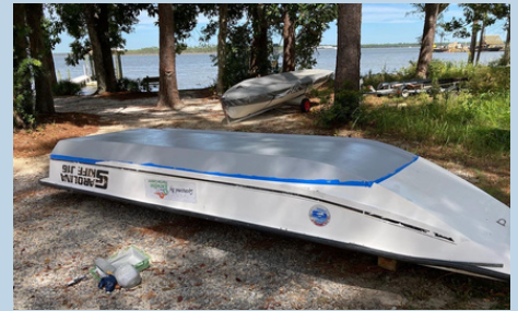
Step 2: Taped, sanded, and primed...